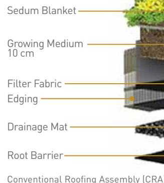
Conventional Roofing Assembly (CRA)